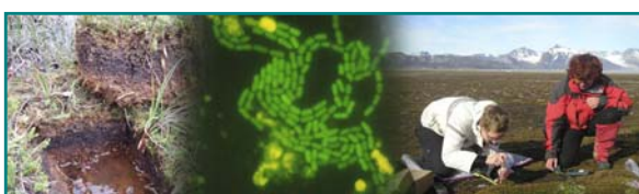
Microorganisms play key roles in Arctic terrestrial ecosystems, here illustrated by methane oxidizing bacteria.