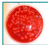
Moritella viscosa dominates in a water sample from a fish tank with experimentally infected salmon