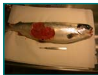
Winter sore in Atlantic salmon caused by Moritella viscosa