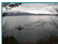
Salmon farming at Lerøy Hydrotech Skårén.